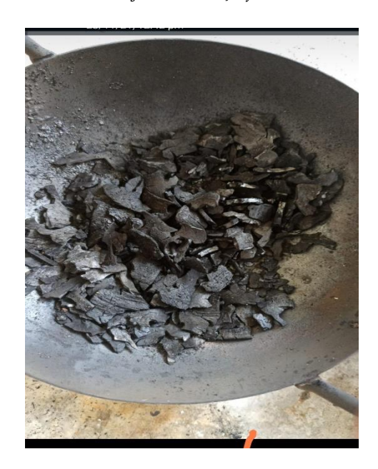
ASH OF COCONUT SHELL