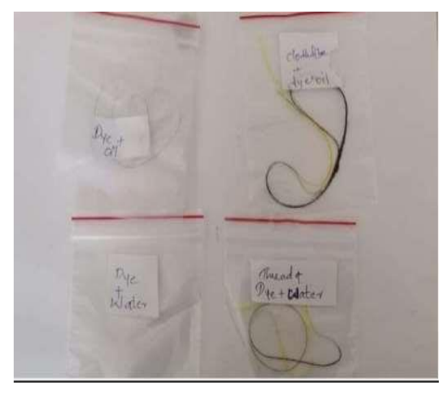
APPLICATION OF HERBAL HAIR ON DIFFERENT SAMPLES BY MIXING ON WATER AND OIL