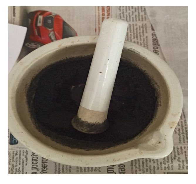
HERBAL HAIR DYE