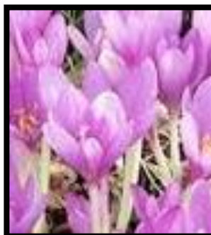
Fig 1: Colchicine flowers

Colchicine exhibits its anti-inflammatory and antiproliferative actions through various mechanisms. Colchicine inhibits the assembly of microtubules by forming a tubulin-colchicine complex. As a result, release of inflammatory mediators and movement of intercellular granules is interfered with. 3 It gets accumulated in the leucocytes and diminishes their motility. It affects the adhesion of neutrophils to vascular endothelium and cytokines synthesis such as interleukin-1 beta. 4 This mechanism play a vital role in the interruption of inflammatory cell activation. Colchicine gets accumulated in the leucocytes at a concentration higher than plasma levels, resulting in suppression of these cells at clinically used doses. 5 Colchicine is also found to suppress activation of the Nod-Like Receptor Protein 3 (NLRP3) inflammasome, resulting in suppression of caspase-1 activation and release of IL-1 \beta and IL-18. 6 It is useful in treating neutrophils and monocytes/ macrophages associated diseases as NLRP3 inflammasome are found in myeloid lineage cells. 7