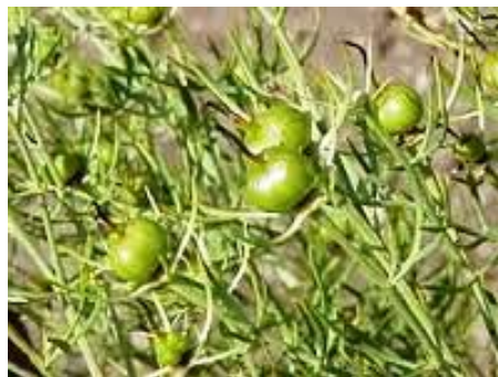
Photograph 2: Seed Capsule of Peganum harmala