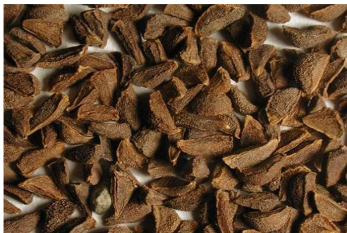
Photograph 1: Seeds of Peganum harmala

Harmal ( Peganum harmala ) is a plant of the family Zygophyllacea, native from the eastern Mediterranean region east to India. It is also known as Wild Rue or Syrian Rue because of its resemblance to plants of the rue family. It blossoms between June and August in the Northern Hemisphere. The flowers are white and are about 2.5–3.8 cm in diameter. The round seed capsules measure about 1–1.5 cm in diameter have three chambers and carry more than 50 seeds (Photograph 1 & 2). It is a perennial plant which can grow to about 0.8 m tall. [15] The Arabic Names for this herb are Ashqaqil, Aspand, Harmal.