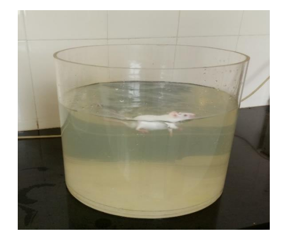
Figure 1: Forced Swimming Test

Group v: Received 40mg/kg of Tapentadol i.p -- TEST 4 (T4)