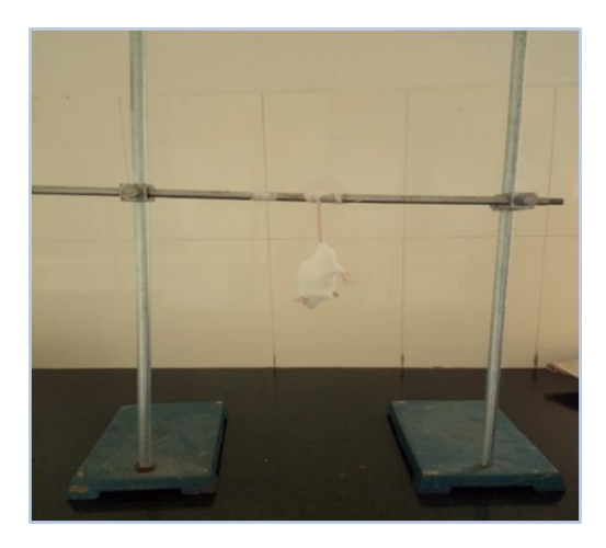
Figure 2: Tail Suspension Test apparatus

On the day of test, mice were hung/ suspended individually on a horizontal metal bar in upside down position, 58 cm above a table top, after giving the drug, using the adhesive tape placed approximately one cm from the tip of the tail [10] (Figure 2). After an initial vigorous movements, the mouse assumes an immobile posture and the period of immobility be recorded after 2 minutes, for 4 minutes in a total of 6 minutes test. Duration of immobility period were compared with those of control group.